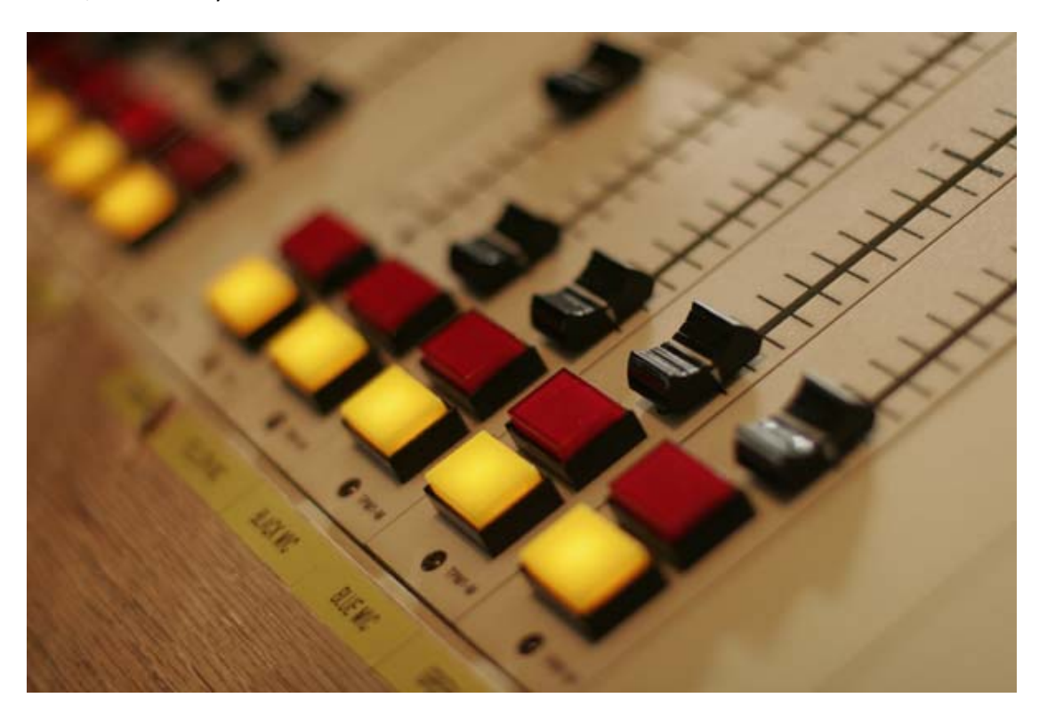
Now let's look at some stuff you need to know about while on air...

This is a good time to identify where each on/off switch and fader is for each mic and other audio/music that you will need to use.